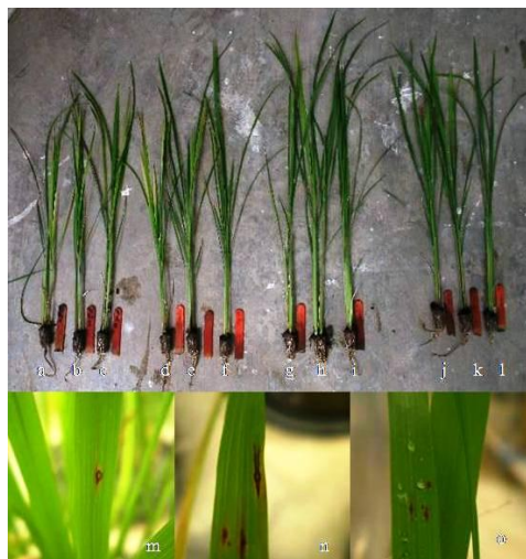
Fig. 2. Twelve treatments used for pathogenicity test of Pyricularia oryzae Cavara Treatments 1(a.-susceptible), 2(b.-intermediate), and 3(c.-resistant) were inoculated with PO1 , treatments 4 (d.-susceptible), 5(e.-intermediate), 6(f. resistant) were inoculated with PO2 and treatments 7(g- susceptible), 8(h-intermediate), 9(i-resistant) were inoculated with PO3 . Distilled water was used as control on treatments 10(j-susceptible), 11(k-intermediate), 12(resistant). Typical leaf lesions on the scale of 3(m, n) and 2(o) found on treatments 2(b, m), 4(d, n) and 5(e, o).

Of significance. Difference on the treatments inoculated with PO2 was due to the different reactions of the used rice varieties which were established by Philippine Seed Board (PSB)/NSIC Rice Varieties (2011, 2009), National Seed Industry Council (2006), Bureau of Plant Industry (2008).