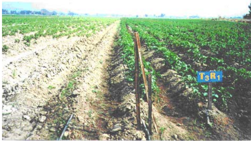
Fig. 2. Experimental plot: with application of chemical fungicide (left) and bio-technique plot (right).