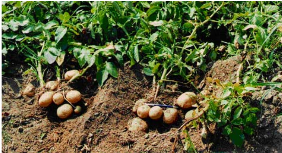
Fig.3. Potato seeds are healthy in bio-technique plot after 90 days harvesting.