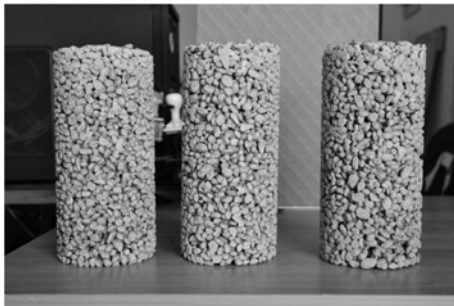
Fig.1 Pervious concrete specimens.

Three specimens were used for each test and the results given in this paper are the average values.