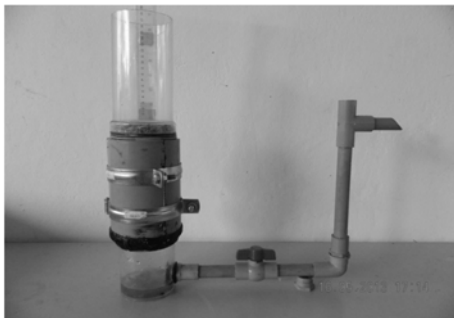
Fig.2 The constant head permeability test set-up.