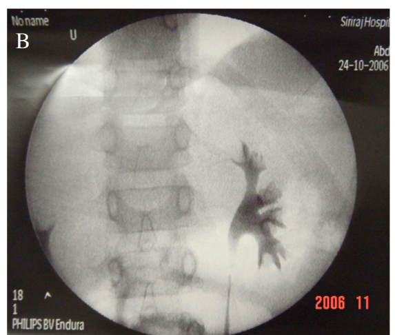
Fig 2–Cystoscopy with retrograde pyelography. A) right side showing a lymphatic fistula tract at the right lower calyx (arrows); B) left side showing normal finding.

out dysmorphic shape, and no presence of crystals. Urine triglyceride was 29 mg/dl whereas serum triglyceride was 137 mg/dl. A urine culture was negative.