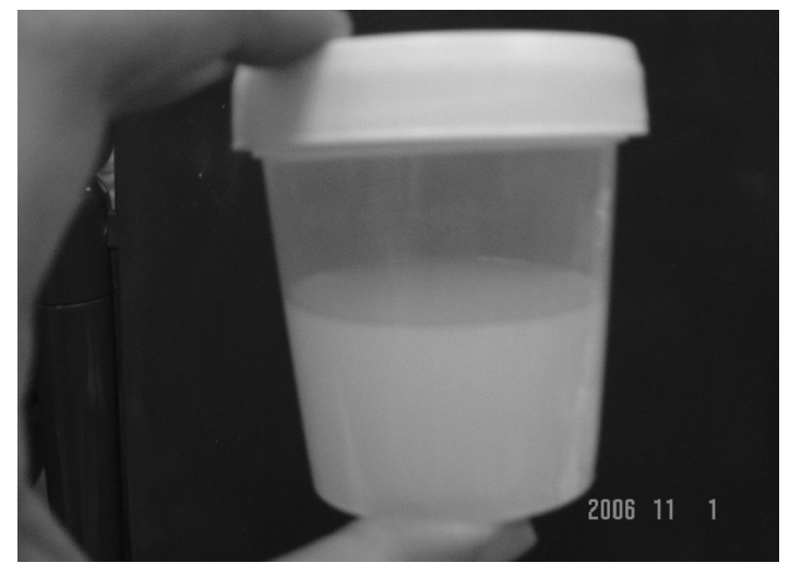
Fig 1–Gross appearance of cloudy white urine.

The consulting pediatric nephrologist noticed that by drinking large amounts of water, the patient's urine became clearer and the patient could void urine without difficulty. The patient had no history of prolonged fever, burning sensation during urination, brownish/reddish urine or unexplained edema of extremities. No history of blunt trauma at abdomen or back, elephantiasis, chronic cough, weight loss, joint pain, hair loss or skin lesions occurred. The patient had traveled to Myanmar four years ago. There was no family history of tuberculosis, chronic cough or kidney diseases. Dietary history revealed regular intake of solid food,