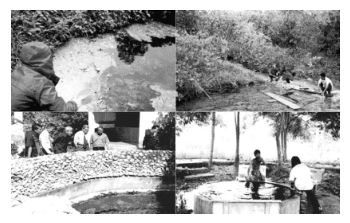
Figs 1-4- Natural hot springs, adjoining man-made bathing facilities and hot spring pound.

Legionella culture and serogroups identification was performed at the laboratory unit of the National Institute of Health, Department of Medical Science, Ministry of Public Health. (Praveenkittiporn et al , 2004). Study of free-living amebae ( Acanthamoeba and Naegleria ) contamination by using fresh direct smear and trichrome staining were performed at Department of Protozoology, Faculty of Tropical Medicine, Mahidol University (Sukthana et al , 2004). The laboratory of the Office of Atoms for Peace in Bangkok determined the radon concentration using a