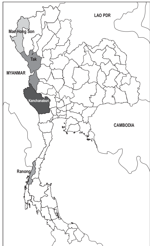
Fig 1—Map of Thailand showing the study areas of Mae Hong Son, Tak, Kanchanaburi, and Ranong Provinces.

In vitro tests for the measurement of the drug sensitivity of P. falciparum followed the standard methodology for the assessment of inhibition of schizont maturation (WHO, 1990). Heparinized capillary tubes were used to collect 100 \mu l of blood from each patient before treatment. Blood