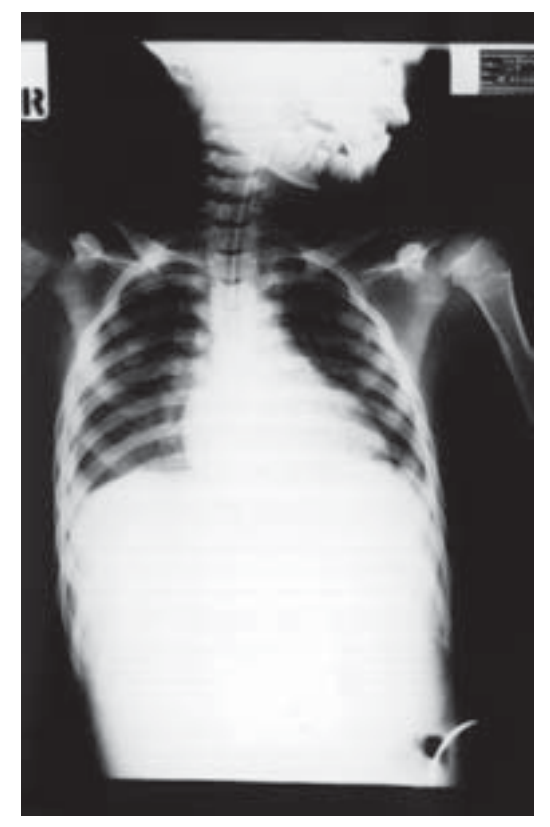
Fig 3-Supine chest radiograph on the third day of treatment.

however, he showed no remarkable improvement and serum albumin level decreased to 3.3 g/dl. On the third day of admission, he regained consciousness and was able to extubate on the forth day of admission. Chest film showed minimal right pleural effusion on the third day (Fig 3) and showed no effusion on the forth day of admission. The malaria trophozoites disappeared from peripheral blood 53 hours after initiation of treatment but the patient still had low-grade fever until the seventh day of admission. Repeated hematologic investigations on the fifth day of admission showed normal findings except mild anemia (hemoglobin 8.5 g/dl, hematocrit 26%). Blood chemistry evaluations on the same day showed decreased blood urea nitrogen (8.0 mg/dl) and creatinine (0.7 mg/ dl), increased albumin (3.9 g/dl), and normal liver function. He was discharged after full recovery on the eighth day of admission.