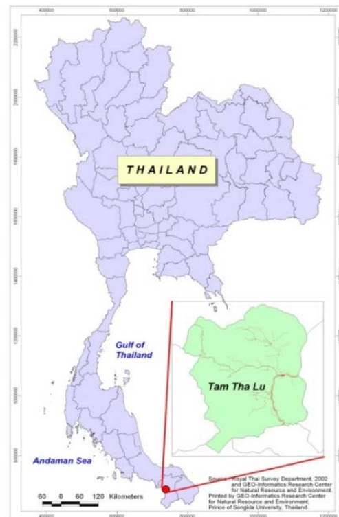
Figure 1 Tamtalu subdistrict in Yala province.

The objective of this study was to reduce exposure of local children to environmental As and Pb in communities located near an abandoned tin mine in Yala Province, southern Thailand.